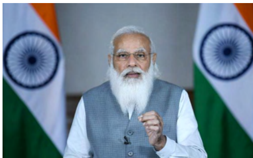
Prime Minister of India Narendra Modi addressing delegates at the 5 th edition of the Viva Tech